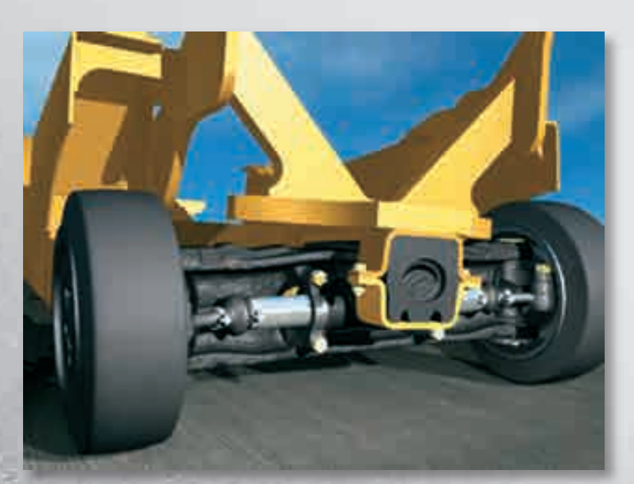
Above: HSM™ (Hyster Stability Mechanism) reduces truck lean in turns, improving lateral stability. The design allows for superior travel over uneven surfaces.

Optional Return to Set Tilt has programmable set points for alignment of mast and forks and is extremely beneficial in applications where product damage can be caused by non-parallel stacking.